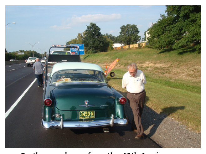
On the way home from the 40th Anniversary But It's giving him something to do now . Getting dirty again Dick?

'51 Ford Speedometer & Gauges 8000 miles on Speedometer Call Jeep 330 472 8167