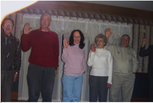
Are these guys all confessing to something?