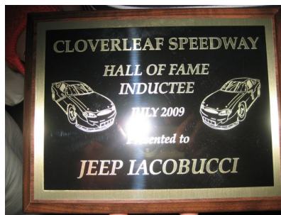
The award Jeep received