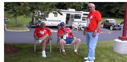
And these are DONE