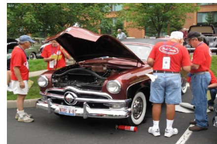
Hummm looks like someone is getting judged