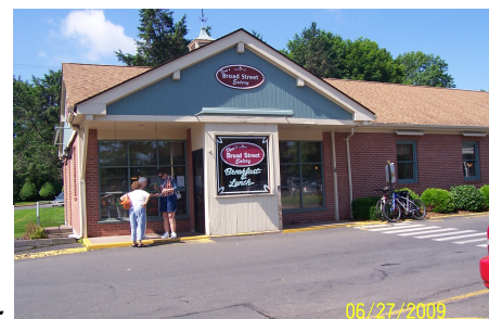
Where we did most of our eating