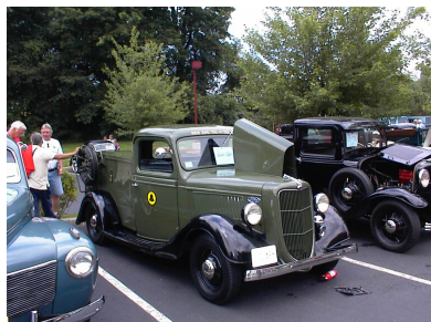
As an ole Bell Employee this caught my eye