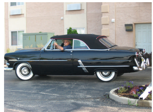
Leaving Ottawa IL on Monday Morning

We arrived in Laramie WY, a distance a bit over 1,400 miles, on Thursday afternoon and decided that the water leak was much more than just that. Turned out to be a blown head gasket., which we expected and decided not to go any farther. We left the vehicle