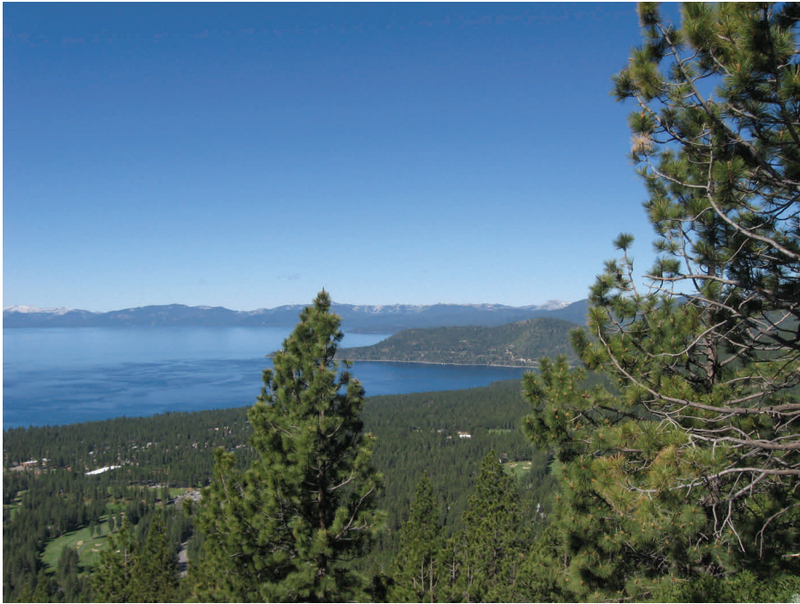
Lake Tahoe California

The following pages really do not do justice to the fantastic job that the Golden Gate, Regional Group #1, of the Early Ford V-8 Club provided to all members and guests that attended the meet June 17 through June 21 at Lake Tahoe, California. We will attempt to share with you the excitement, events and experiences we had the week we were there.