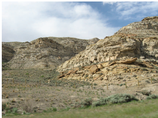
The road from Laramie to Salt Lake City

in Laramie, rented a car and continued on. Although we were extremely disappointed, it turned out to be the correct decision because once out of Laramie there is NOTHING until Salt Lake City. After Salt Lake City another 500-600 miles of nothing until Reno NV..