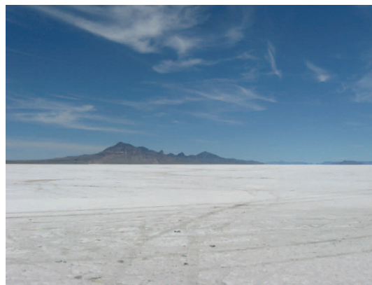
Right: The Bonneville Salt Flats