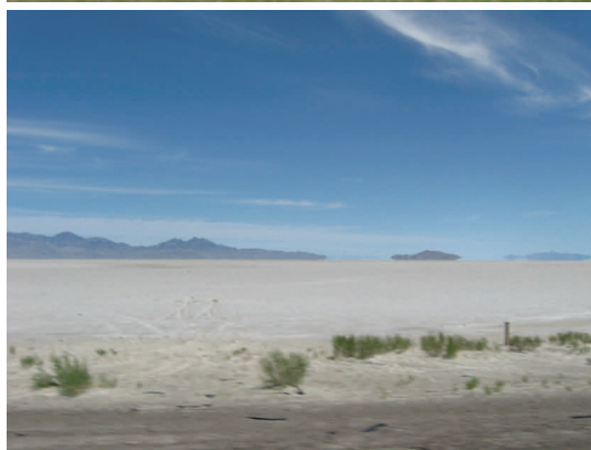
Left: 112 mile journey across the Great Salt Lake