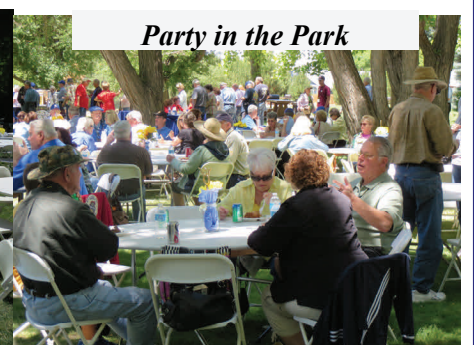
Party in the Park