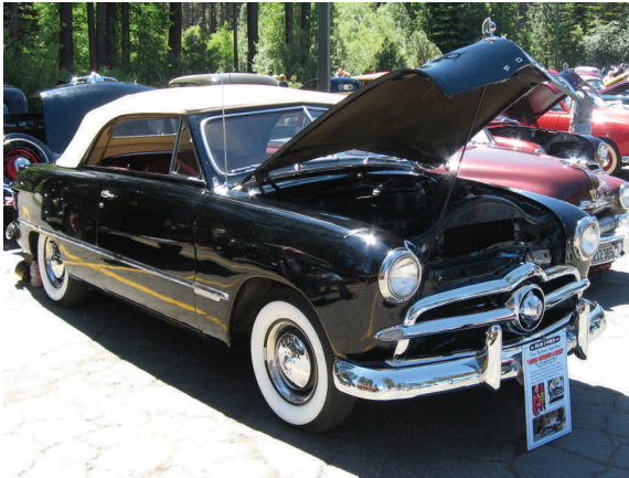
Left: 1949 Ford Convertible featured in the movie Rebel Without a Cause