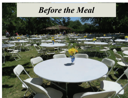
Before the Meal