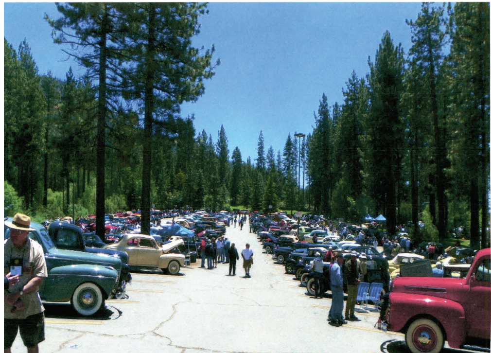
The Concourse on Judging Day