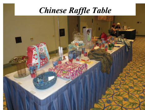
Chinese Raffle Table

The most desired prizes were four hand-made quilts designed by ladies from the Host Regional Group