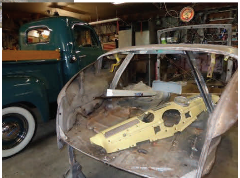
Home in the Collette’s Garage

It is great that another early Ford V-8 is saved and will remain within our Regional Group. The attached photos illustrate the magnitude of the “project”.