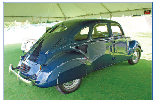
* 1935 Hoffman X-8 Sedan *