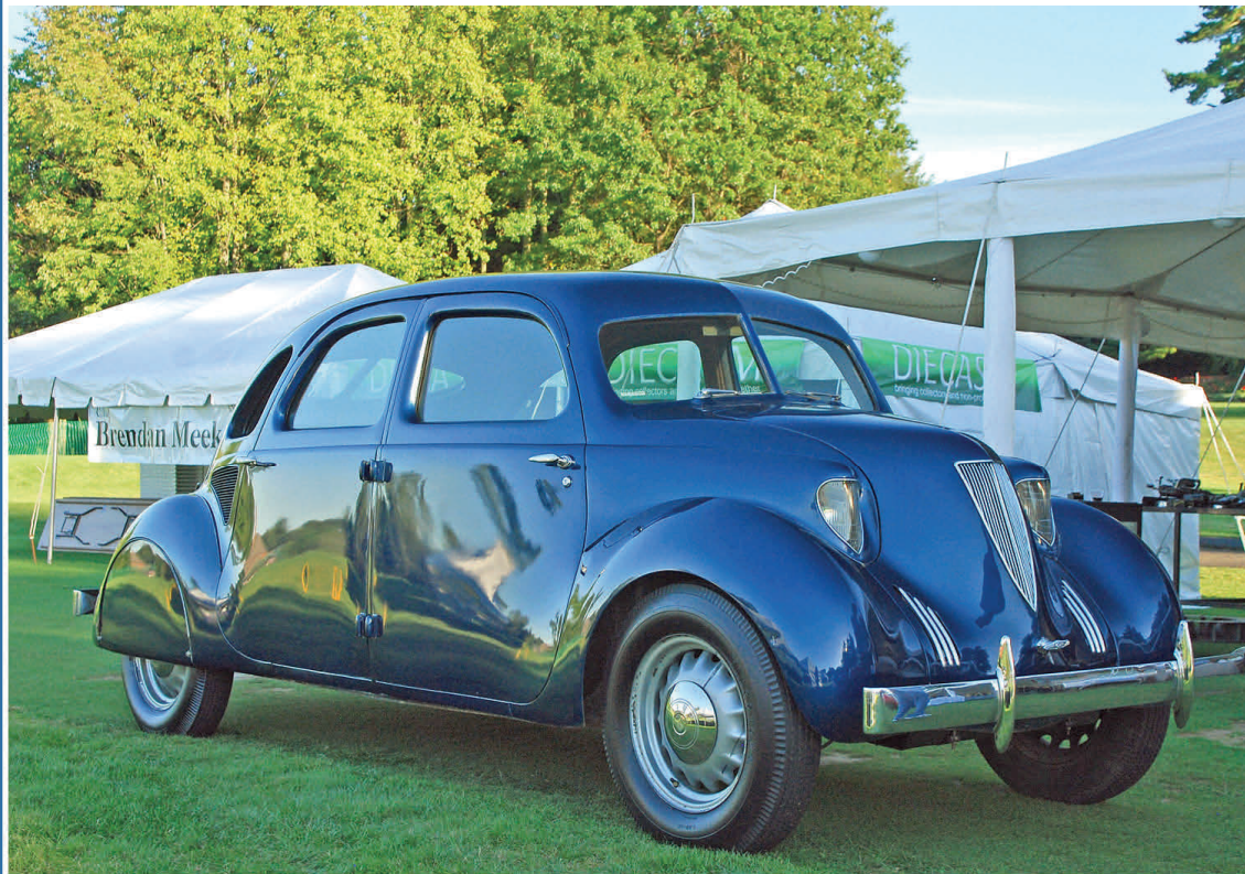
* 1935 Hoffman X-8 Sedan *