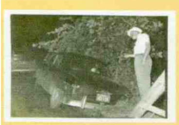
Stolen '49 Ford found stuck along muddy Kansas road.