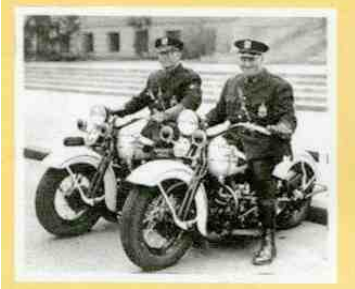
St. Louis Police pulled over the stolen Ford