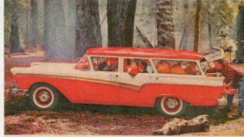
There's no wagon like a Ford wagon