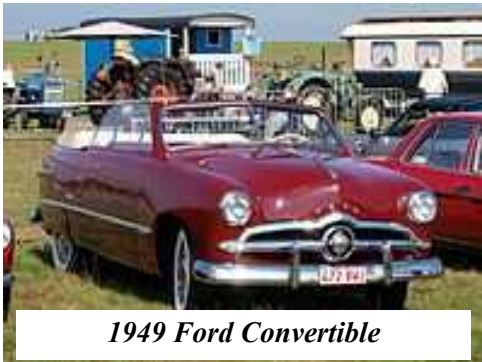
1949 Ford Convertible

The 1949 Ford was the first all-new automobile design introduced by the Big Three after World War II, civilian production having been suspended during the war, and the 1946-1948 models from Ford, GM, and Chrysler being updates of their pre-war models. Popularly called the "Shoebox Ford" for its slab-sided, "pontoon" design, the 1949 Ford is credited both with saving Ford and ushering in modern streamlined car design with changes such as integrated fenders and more. This design would continue through the 1951 model year, with an updated design offered in 1952.