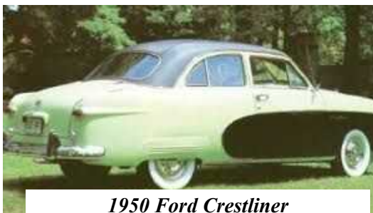
1950 Ford Crestliner

vehicles for many decades in one form or another. A Deluxe Business Coupe was also marketed