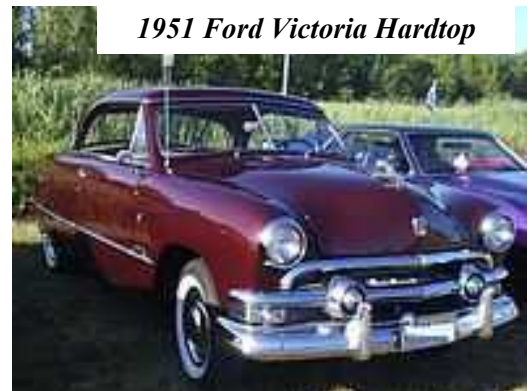
1951 Ford Victoria Hardtop

The 1951 Fords featured an optional Ford-O-Matic automatic transmission for the first time. Ford finally answered the Chevrolet Bel Air and Plymouth Belvedere charge with the Victoria hardtop in 1951, borrowing the term from the Victoria Carriage. The car was an instant hit, outselling the Chevrolet by nearly 10%. The Crestliner continued for one more year, however. All 1951 Fords sported a new "dual-bullet" grille and heavy chrome bumpers. This year Ford also added a new "turn-key" ignition. Front suspension is independent coil springs. Head room was 36.1 inches