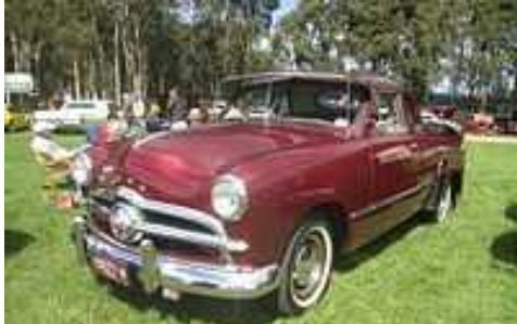
1949 Ford Coupe Utility-Australian

at the time to be the car that saved the Ford Corporation. Competition from GMH was surpassing the Old Ford designs. In some ways the vehicle was rushed into production, particularly the door mechanism design. It was said that the doors could fling open on corners. In the 1950 model there were some 10 changes in the door latching mechanism alone.