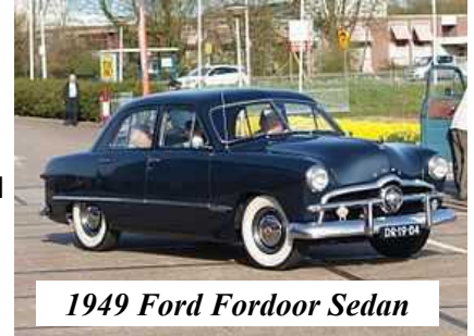
1949 Ford Fordor Sedan

The group was part of a management science operation within the Army Air Force known as Statistical Control, organized to coordinate all the operational and logistical information required to manage the waging of war. They participated in the broader revolution in logistical and organizational science that World War II fostered. After the war, some of the group discussed opportunities to go into business together.