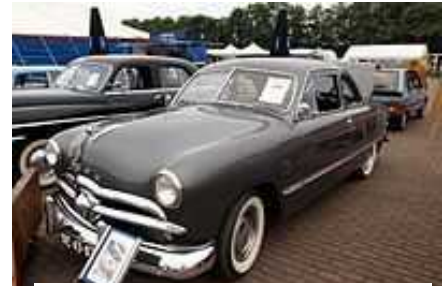
1949 Ford Tudor Sedan

From a customer's perspective, the old Custom, De Luxe, and Super De Luxe lines were replaced by new Standard and Custom trims and the cars gained a modern look with completely integrated rear fenders and just a hint of a fender in front. The new styling approach was also evident in the 1949 Mercury Eight and the all-new Lincoln Cosmopolitan. The styling was influential on many European manufacturers, such as Mercedes Benz, Borgward, Austin, Volvo and many others. The all new 1949 Ford was said