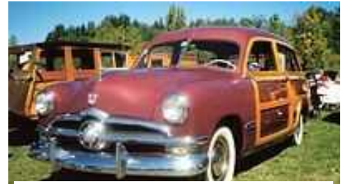
1950 Ford Country Squire

of the 1990s. The 1949 and 1950 styling was similar, with a single central "bullet" in the frowning chrome grille. In the center there was a red space that had either a 6 or 8 depending if the car had the six-cylinder engine or the V8. The trim lines were renamed as well, with "Standard" becoming "Deluxe" and "Custom" renamed "Custom Deluxe". The new Fords got the now-famous "Ford Crest" which appeared on the division's