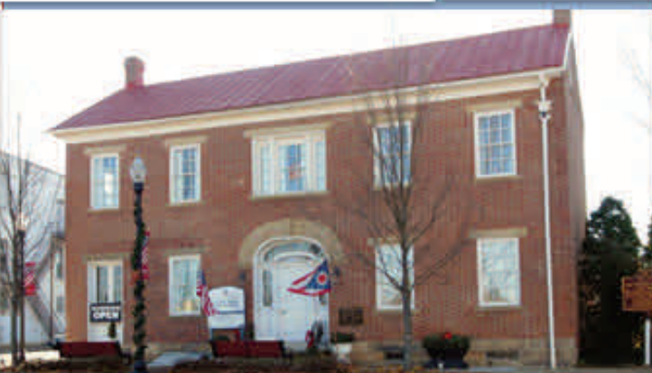
Mc Cook House Civil War Museum