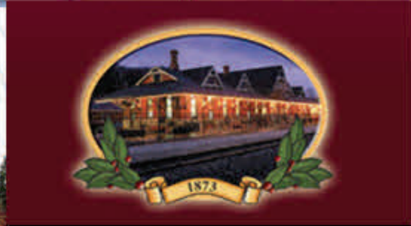
Dennison Railroad Depot Museum