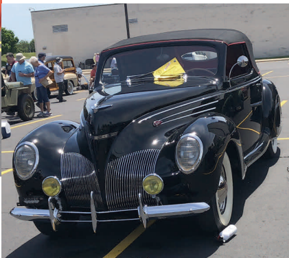
1939 Lincoln Zephyr