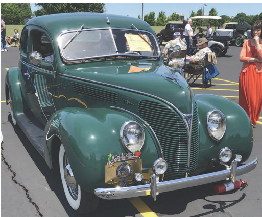
1938 Ford Deluxe Coupe