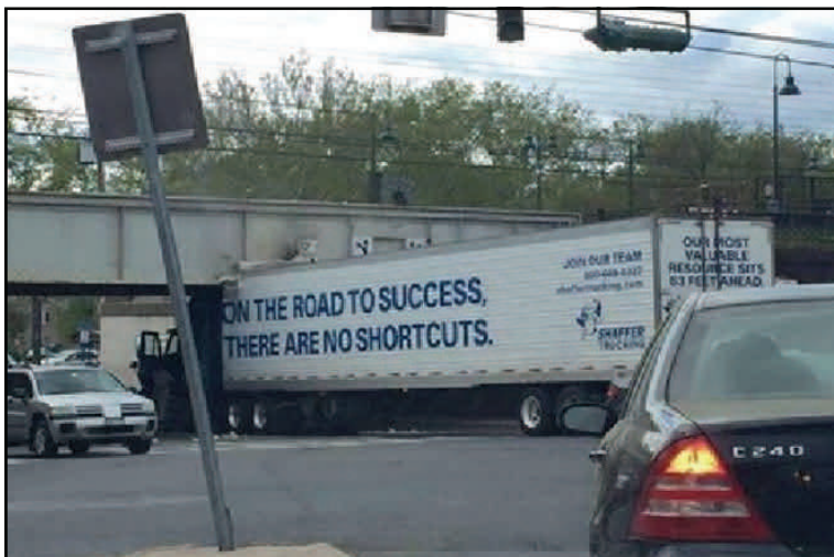
Maybe He shouldn't have taken the shortcut