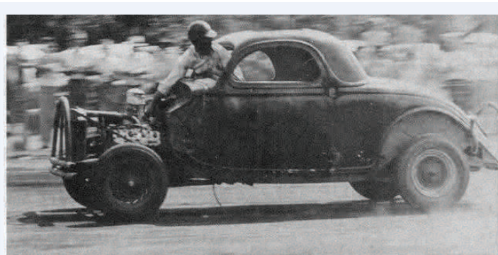
In the inaugural heat on June 4, 1950, driver Vittie Cothron was running third on the last lap when his carburetor linkage fell off. Vittie reached through the windshield and held the carburetor open with one hand, steered with the other and finished third.