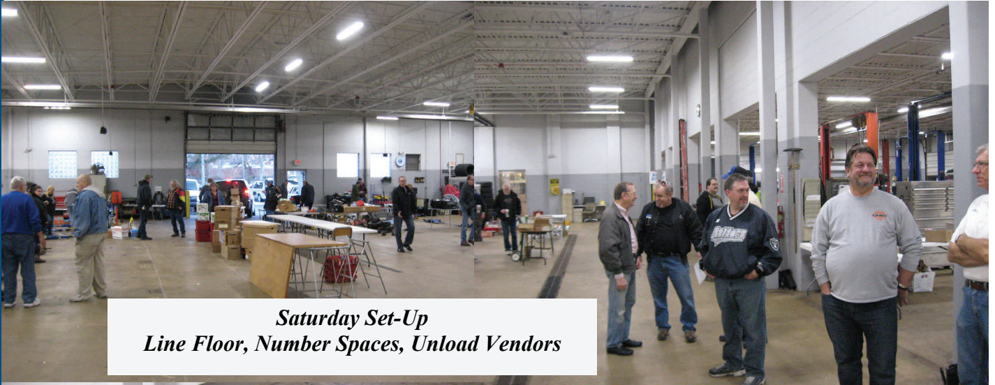
Saturday Set-Up Line Floor, Number Spaces, Unload Vendors