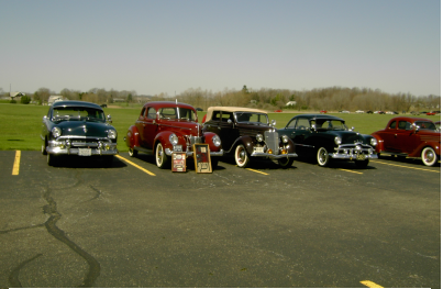
V-8's and Nifty-Fifties Cars