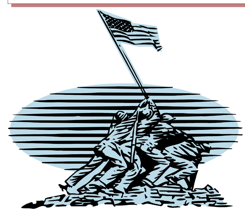
M.ay 28,2007 M.emorial Day Let us remember everyone Let us Pray for <u>ACC</u> Our Fighting M.en