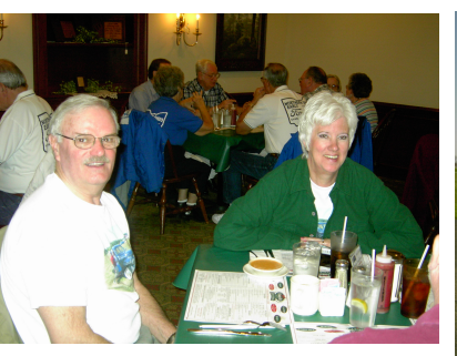
The Party Planners