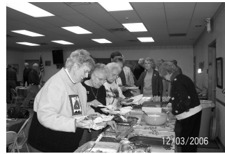
Everything looks so good