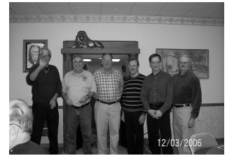
New Officers and Board