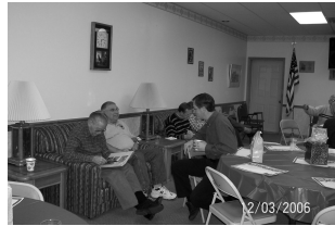
Talking about past years