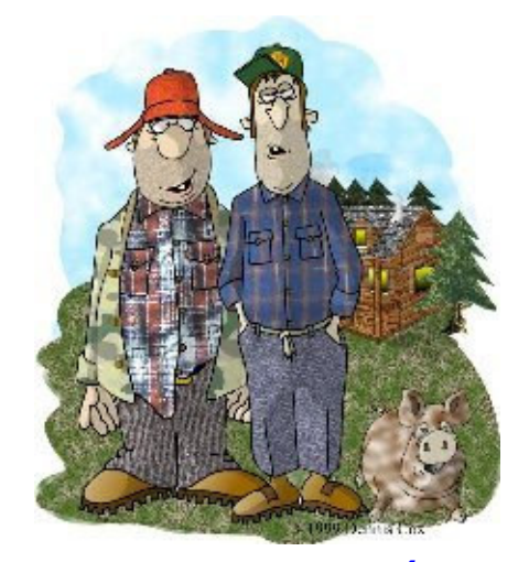
Rags, Jeep & Snuggles