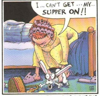
THE EASTER BUNNY GETS A RUDE AWAKENING.

If you wish to have a picture of your car or cars on the site email a scan to him anytime OR bring a picture to a meeting